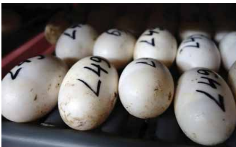
Crocodile eggs collected by the local communities

Depending on species characteristics (Section 2.1), various policy measures can be used to create positive conservation incentives and outcomes. This may include the issuance of permits, licensing or tradable quotas to facilitate trade at a level consistent with sustainable use, as well as requirements or payments for tagging, monitoring, reporting, labelling, species stewardship and/or habitat management. For example, under Argentine legislation, landowners are compensated for the number of broad-snouted caiman ( Caiman latirostris and C. yacare ) nests found on their property, providing a strong incentive for landowners to conserve nest sites and natural wetlands. Supplemented with community managed captive-rearing programmes – whereby wild eggs are collected and moved to facilities (mostly for the skin trade and the remainder for subsequent release) – there is a strong incentive for locals to protect live resources in situ. This approach has seen a steady annual increase in caiman populations, which were previously under threat, while similarly creating viable business opportunities (Larriera, forthcoming; US Fish and Wildlife Service, 2013).