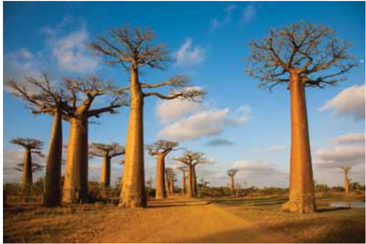
Baobab trees in Madagascar

Shifts in quantity demanded can have conservation and livelihood impacts. If demand falls, prices are likely to drop, reducing incentives for conservation and livelihood benefits of trade participation.