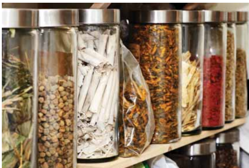
Traditional Chinese medicinal herbs and remedies in jars

The elasticity of demand measures the responsiveness of demand to changes in price and income. Demand elasticity for wildlife is largely determined by the availability of substitute goods. Products that are price elastic typically have a number of substitutes. For example, according to one study, bush meat and fish are substitutes in Gabon, meaning that demand for bush meat falls in response to any increase in price as consumers shift to fish consumption (Wilkie et al., 2005). Harvesters and producers benefit from developing a sustainable and consistent supply of these products, as consumers are unwilling to pay higher prices if supply is reduced.