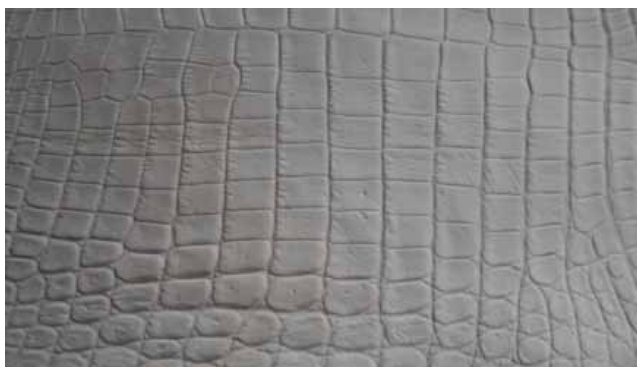
Crocodile skin from Madagascar

Consumers may have a strong preference for wild-sourced products that are perceived to be of higher quality. For example, Chinese consumers appear to prefer wild tiger bone products due to perceptions of higher potency (Gratwicke et al., 2008) and similarly, consumers in South-East Asia prefer wild porcupine ( Hystrix brachyural ) meat over that from porcupines bred in captivity (Norsuhana et al., 2012). For others, intensively managed wildlife is preferred. For high-end buyers of crocodilian and tiger skins, captive bred specimens are preferred as they produce more consistent quality skins with less scarring or other defects (MacGregor, 2006).