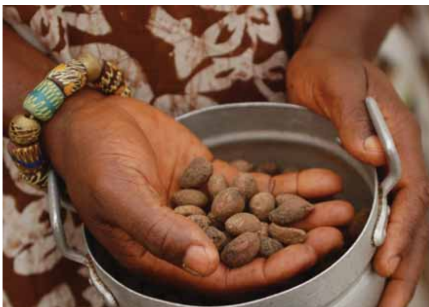
Wild shea nuts obtained from shea trees

A significant share of global wildlife resources is in developing countries, in areas where rural and remote communities live and work. These communities have the potential to benefit from international demand for wildlife products. For example, Peru exports more than US$ 300 million of biodiversity-based products a year, and this employs more than 10,000 people, mainly in rural areas (UNEP 2013). In Burkina Faso, wild-sourced shea butter (from the shea tree Vitellaria paradoxa ) is the fourth-largest export product after gold, cotton and livestock (Konaté, 2012).