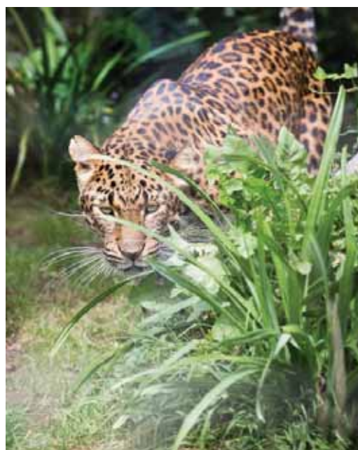
Chinese leopard

However, the effectiveness of trade restrictions in achieving conservation outcomes depends on several factors, particularly the capacity of countries to monitor and enforce them (IUCN, 2001; Cooney and Jepson, 2006; Conrad, 2012). The economic cost of enforcement can be high, particularly when species are distributed across a large area or when demand is high or inelastic (such as products without acceptable substitutes). These factors can increase the susceptibility of species to corruption and illegal trade and add costs to effective enforcement, which is particularly burdensome for lower-income countries (Cooney and Jepson, 2006; 't Sas-Rolfes, 2000; Biggs et al., 2013).