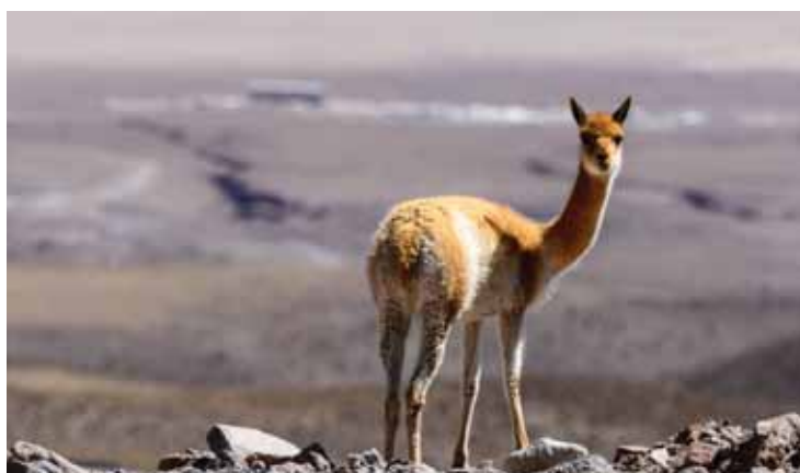
Vicuña is a valued resource for Andean communities

Wildlife harvest for trade can be maintained at sustainable levels, consistent with biodiversity conservation. Beyond this, however, wildlife trade can have positive conservation impacts where it creates incentives for sustainable use and management of target species and their habitats. For example, developing a well-managed international trade in vicuña ( Vicugna vicugna ) fibre has led many local communities to view vicuña as a valued resource rather than – as previously – a pest and competitor for grazing land. Consequently, poaching has declined