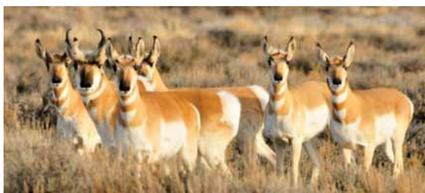
Pronghorn is listed in CITES Appendix I.

Greater rarity and regulation may themselves increase the appeal of particular species among certain consumers, adding incentives for harvest (often illegal) and raising conservation threats (Courchamp et al., 2006; Rivalan et al., 2007; Hall et al., 2008). For example, Courchamp et al. (2006) present data showing rarer butterflies attract higher prices among collectors, as do CITES-listed species compared to non-listed ones. Rivalan et al. (2007) show that