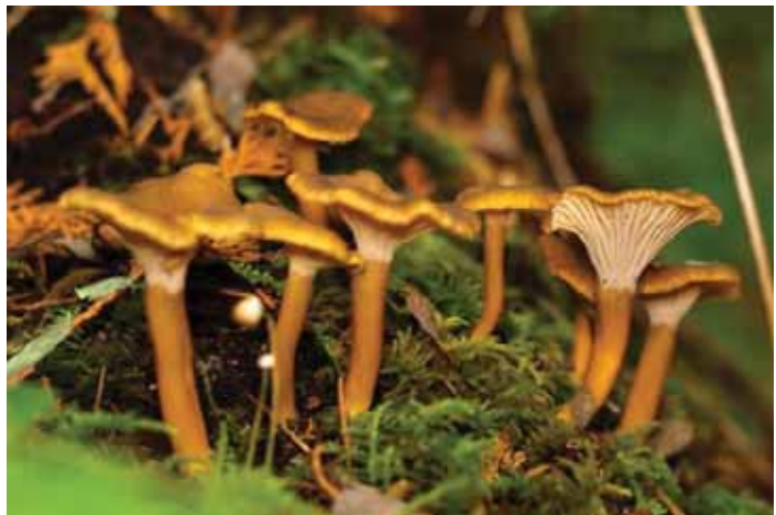
Trade in biodiversity benefits local communities