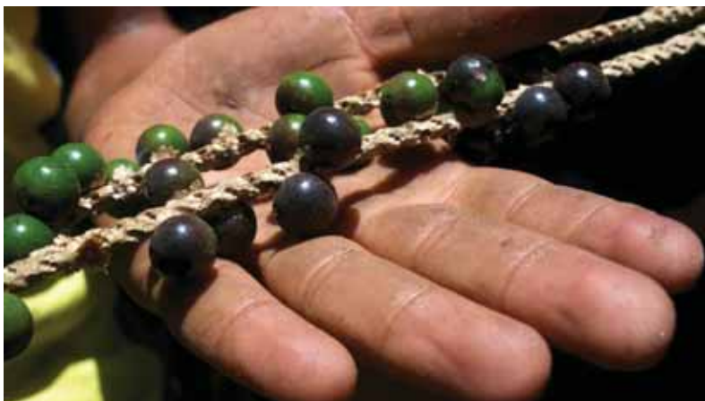
Açai fruit

Many wildlife species and parts traded internationally are collected or harvested from the wild. In general, wildlife resources are renewable and consequently can withstand some level of harvest. However, some species are less resilient than others, affecting their potential for sustainable use in trade. Both biological and non-biological factors can influence species resilience (see Box 2). A species' capacity to recover from harvest, however, will also be dependent on the scale of harvest itself. For example, having broad distribution and habitat specificity may only confer higher resilience if the harvesting process does not span the entire range and habitats of the species.