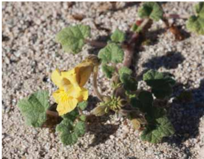
Local communities benefit from harvesting devil's claw.

cases, employment in value-add activities, such as processing and other upstream activities, also provides livelihood opportunities.