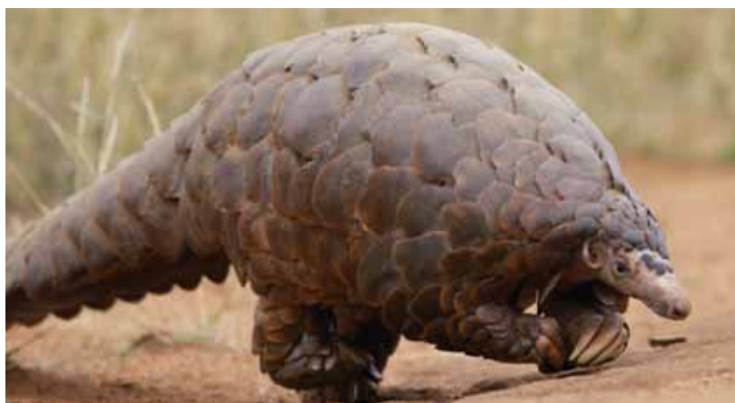
Pangolins are frequently found and captured in human settlements

Accessibility, in general, has positive benefits for those involved in trade. Trade in species located close to poor communities can create valuable livelihood opportunities. Generally, there are fewer skills and equipment requirements for harvesting accessible species. Notably, the cost of managing immobile species (such as trees) is typically lower than ‘fugitive’ species that move between jurisdictional boundaries, such as guanaco ( Lama guanicoe ) and migratory fish species (Lichtenstein, 2013).