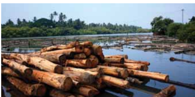
Timber trade

Growing international wildlife trade has major conservation and livelihood repercussions. In this report, conservation impacts refer to impacts on both biodiversity and habitat conservation. Livelihood impacts include effects on people, specifically their capabilities, means of living, income, assets and wellbeing (Chambers and Conway, 1991). In this report, the livelihoods at the centre of discussion are those of the rural communities, particularly in developing countries, that live alongside wildlife and are most dependent on wildlife resources.