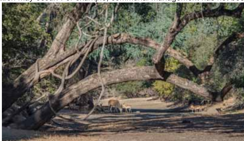
Wildlife conservation area in northern Zimbabwe

Where wildlife is valued for trade, secure property rights for users can provide groups with an incentive for sustainable management. However, without market value (or other cultural or social incentives for sustainable management) overexploitation may occur. For example, communal management has not been effective for woodlands in Zimbabwe, which may be due to the poor returns gained from woodlands because of poor soil, limited rainfall and consequent low productivity. These returns may not be enough to justify investments in building effective management institutions (Campbell et al., 2001). This is in contrast to Zimbabwe’s CAMPFIRE wildlife-management programme, where returns for safari hunting of elephant have provided strong incentives for sustainable resource management (Child et al., 1997; Campbell et al., 1999).