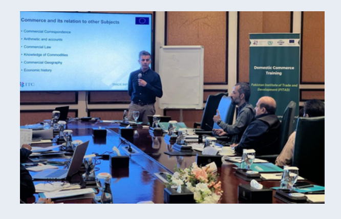
Training on domestic commerce for officials from the Ministry of Commerce and Industries in Islamabad