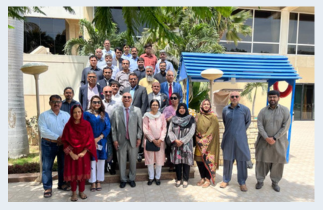
Public Private Dialogue held on SPS curriculum for government officials, private sector stakeholders, and partner organization representatives in Karachi