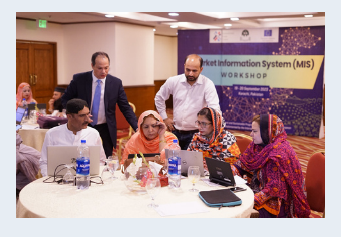
Workshop on Market Information Systems (MIS) for officials from Balochistan