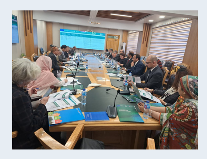
Provincial Steering Committee for Balochistan was held in Quetta, attended by EUD and Core Partners. GRASP work in Balochistan was appreciated, a new category for matching grants was requested, and the work plan for new year was formally approved.