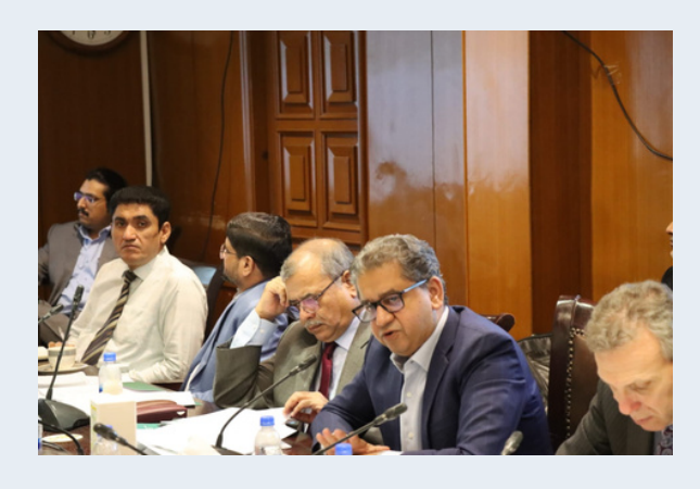
Provincial Steering Committee for Sindh was held in Karachi under the Chairman Planning and Development Board. The committee aknowldeged the great work done by the project in Sindh, and endorsed workplan for the upcoming year.