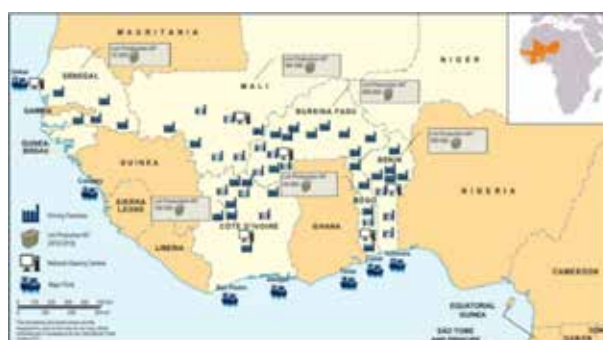
Map of West Africa cotton production