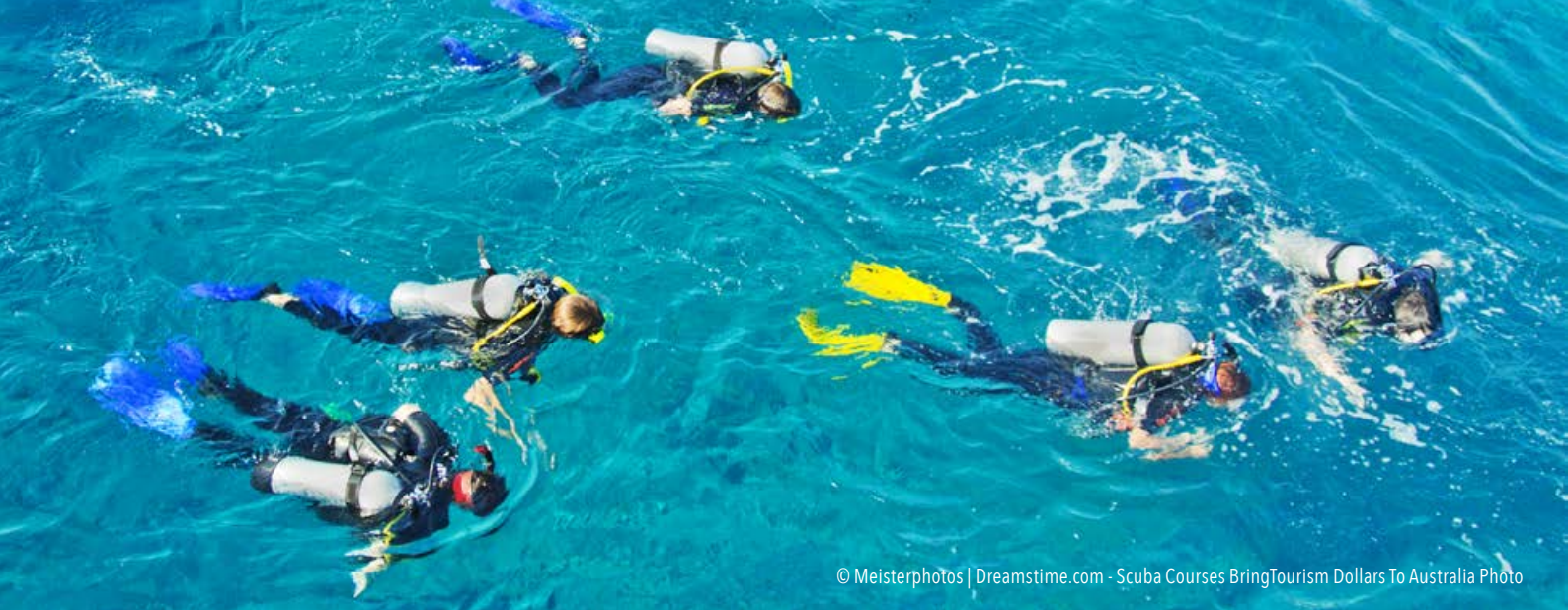
Scuba Courses Bring Tourism Dollars To Australia Photo