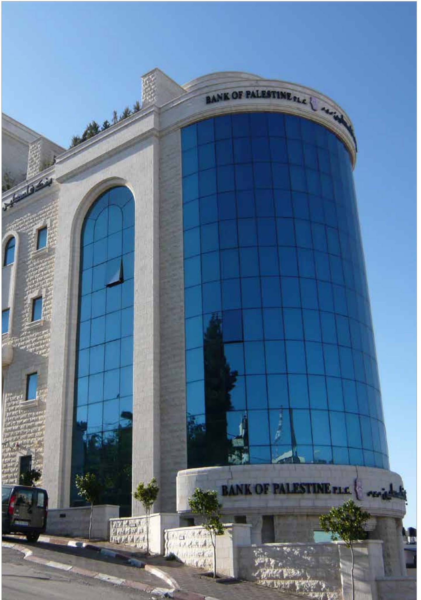
Bank Of Palestine Head Office - Ramallah, Palestine