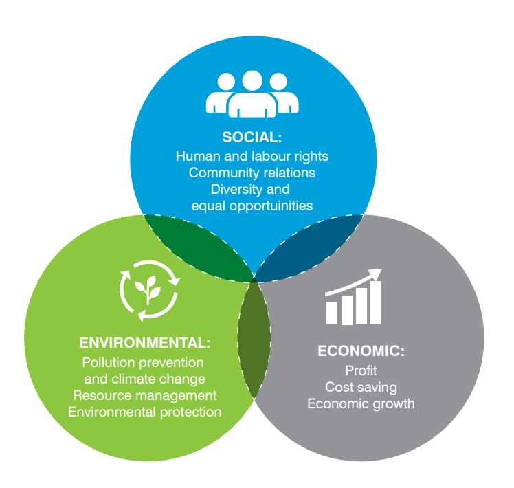
Figure 1 The three pillars of sustainability

Social: Proactively managing the positive impact of business operations on people and society.