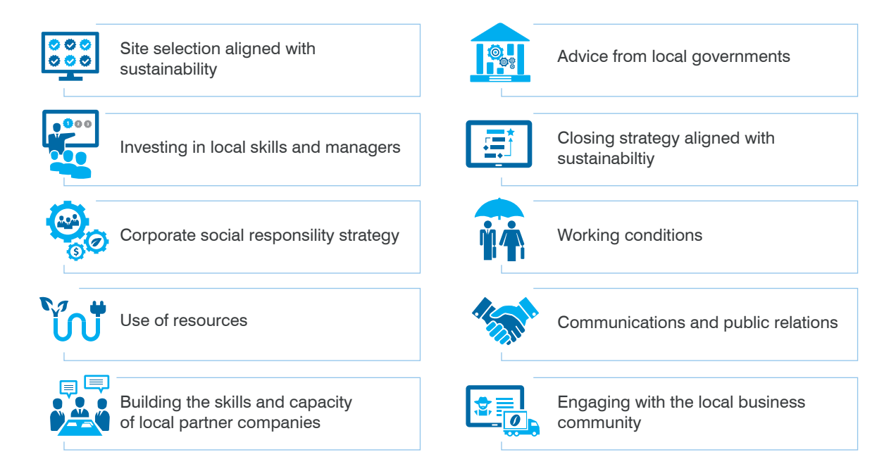
Figure 4 Additional measures for sustainable business conduct

This chapter introduces a number of measures that companies can incorporate into their business operations in Mozambique, to help implement a sustainable approach (summarized in Figure 4). Relevant Chinese and international voluntary standards are also highlighted at the end of the chapter.