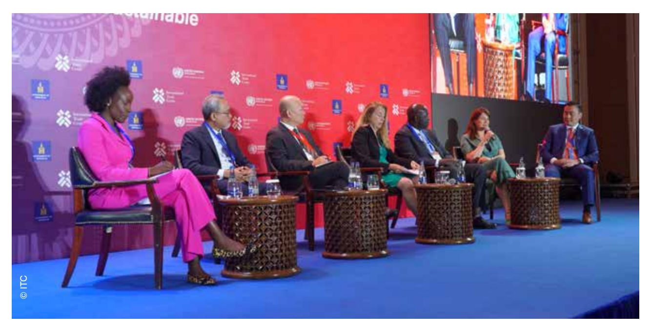
From left to right: ITC alongside speakers representing Malaysia, Vietnam, the European Union, Kenya, the Netherlands and Mongolia discuss the green future of trade

Managing Director, The Netherlands' Centre for the Promotion of Imports from Developing Countries