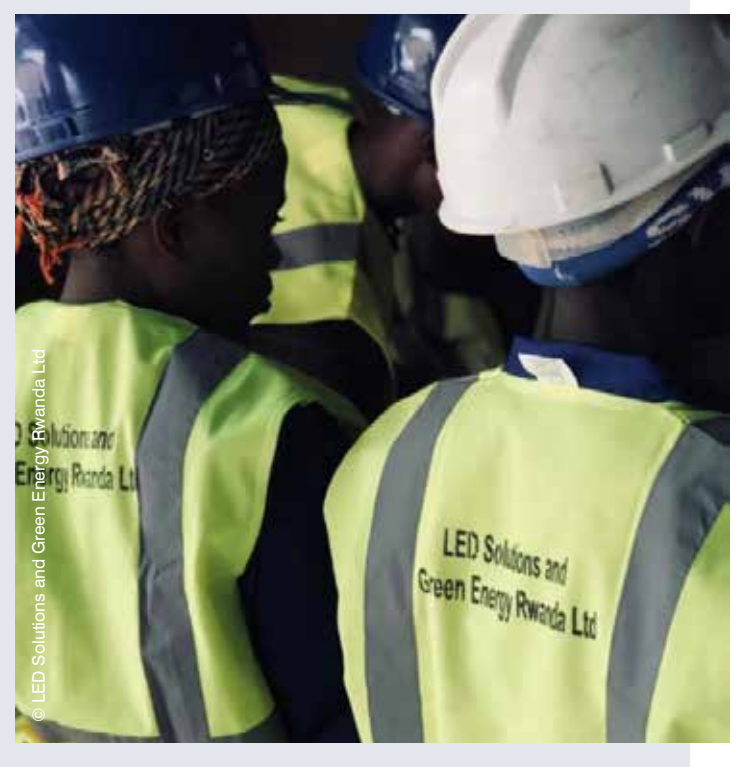
Technicians at Green Energy Rwanda's first operational hydro power plant