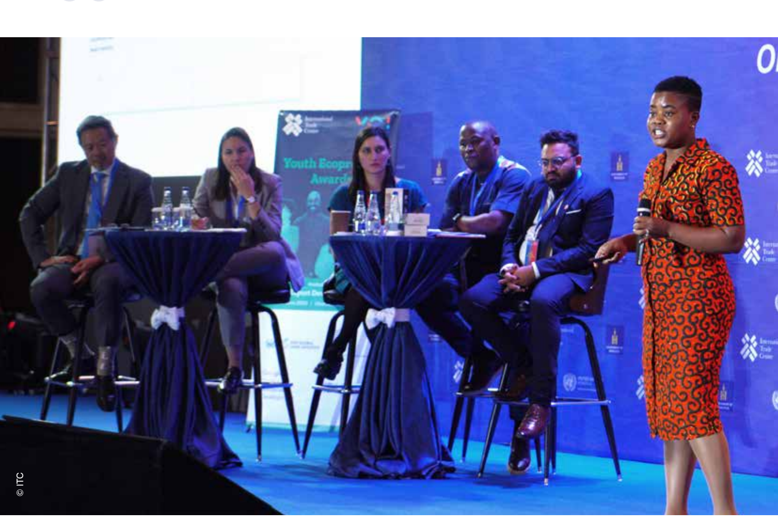
From left to right: Youth Ecopreneur Awards jurors from the World Intellectual Property Organization, the UN Convention to Combat Desertification, Sidley Austin, Zimtrade, and RecycleX evaluate a young ecopreneur's pitch at WEDF 2023

Founder, RecycleX, India; Previous Youth Ecopreneur Awards winner