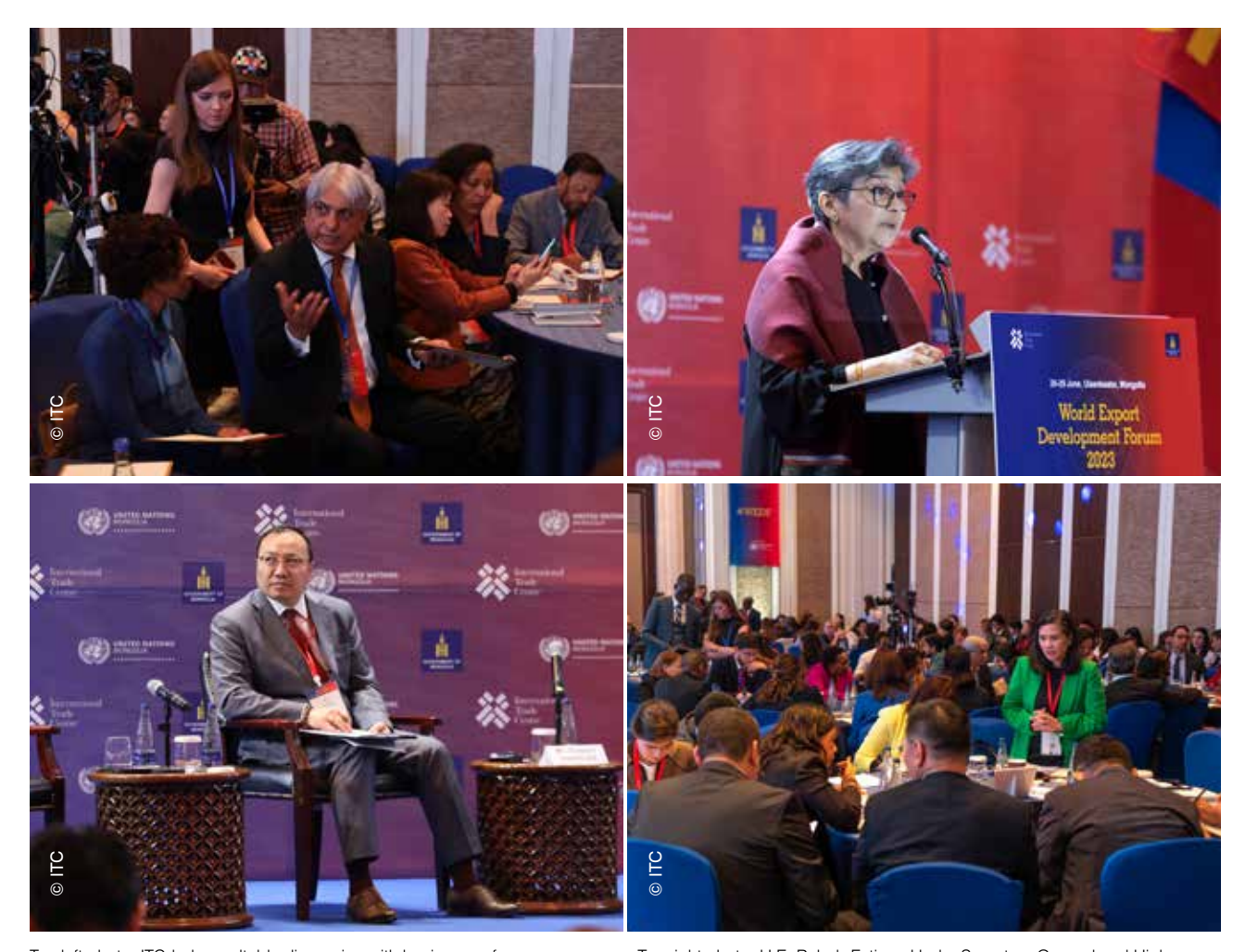
Top left photo: ITC-led roundtable discussion with businesses from Landlocked Developing Countries

Bottom left photo: The International Think Tank for Landlocked Developing Countries served as rapporteur for the consultations