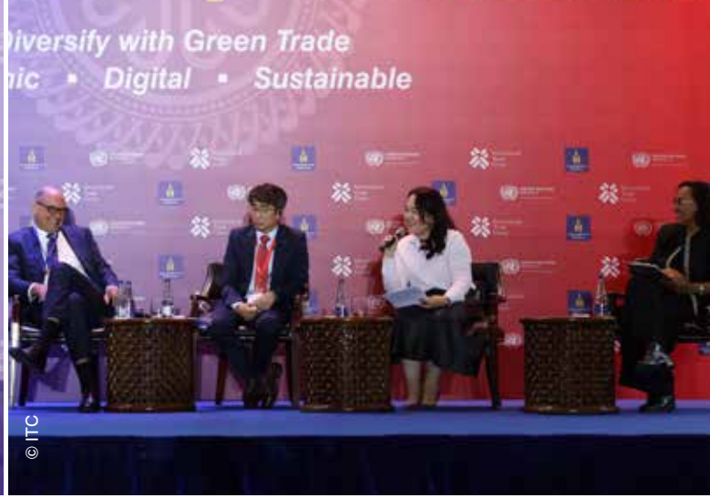
ITC alongside Trade Finance Global