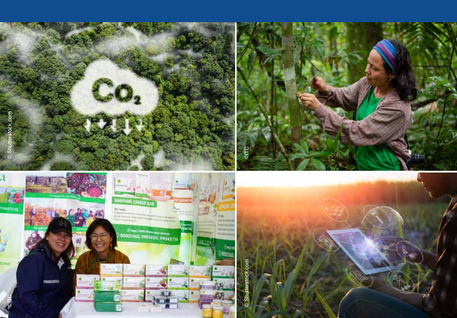
Bottom left photo: A Mongolian MSME specializing in organic cosmetics made from sea-buckthorn showcasing products on International MSME Day

"If the world goes towards slow fashion, Mongolia produces high quality, organic, biodegradable fibres, drawing on centuries of history as nomadic herders."