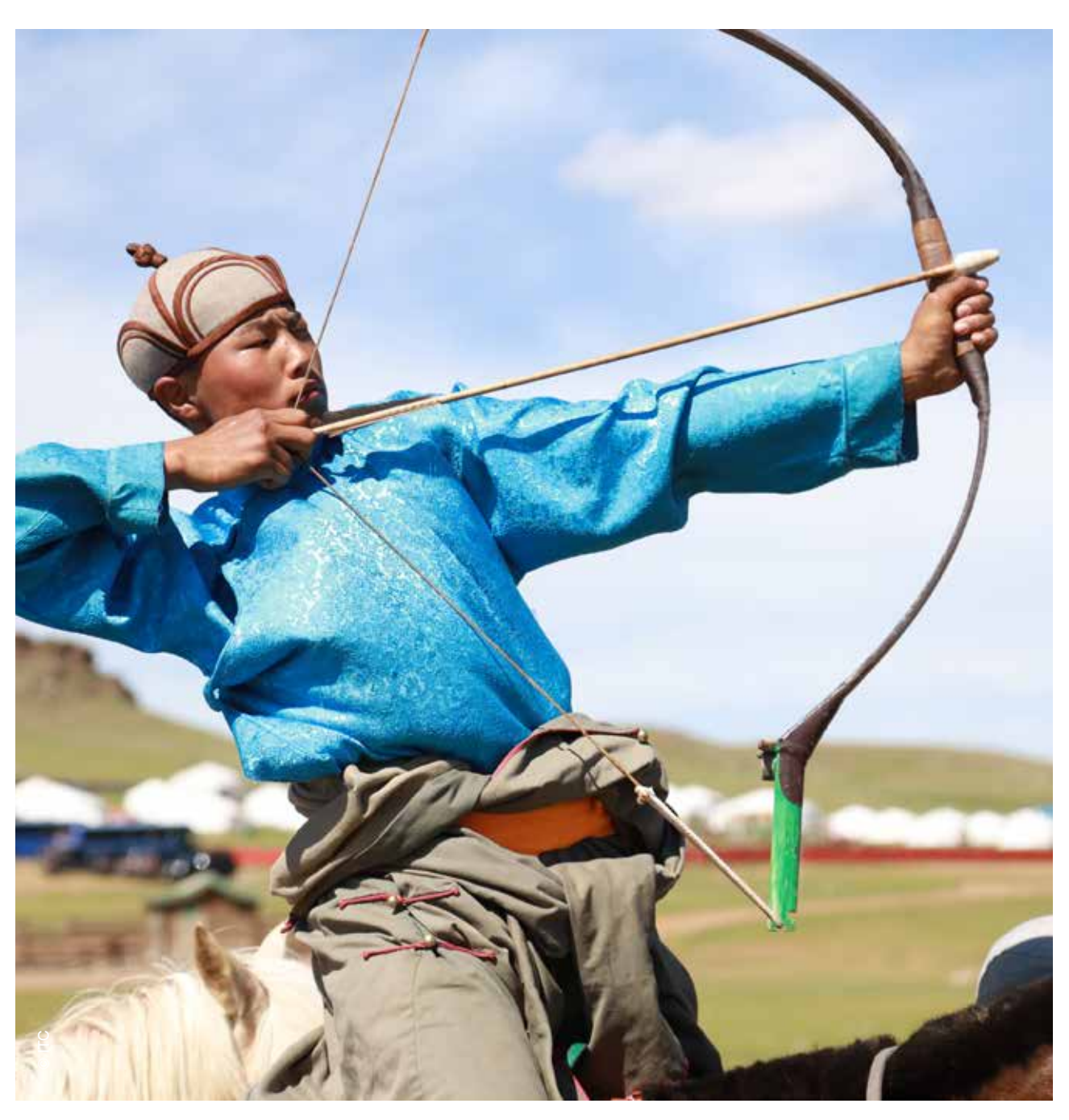
Traditional horseback archer demonstrates his skill for WEDF participants