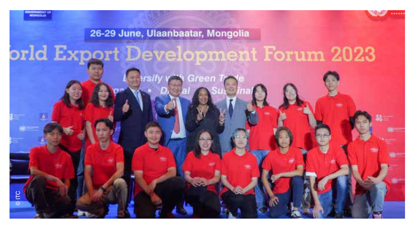
Mongolian university students of finance and economics supported WEDF 2023.