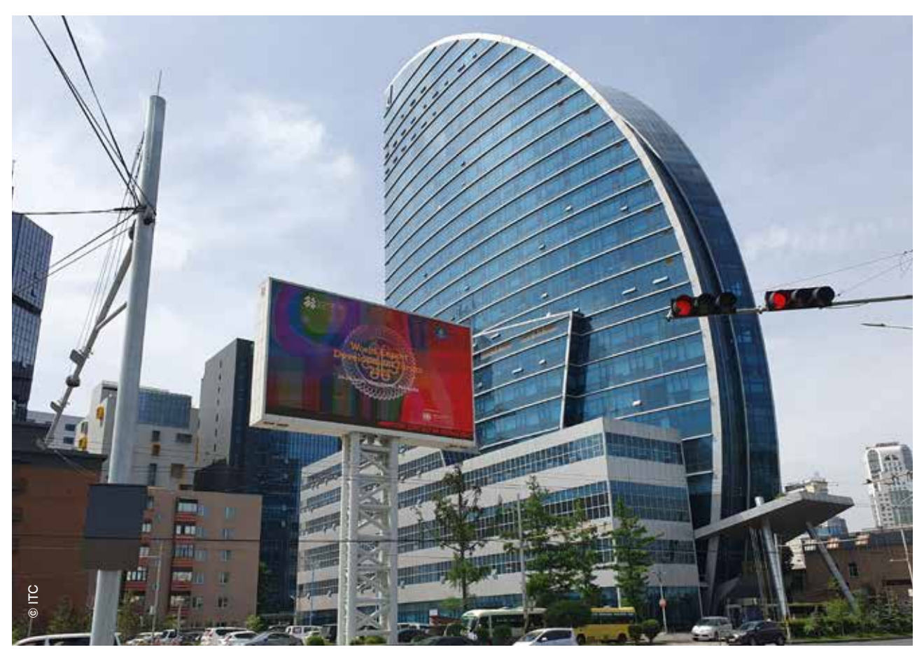
WEDF branding on display across Ulaanbaatar.